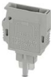
Component connector, with diode 1N4007, length: 24.2 mm, width: 5.2 mm, height: 33.3 mm, number of positions: 1, color: gray

Please be informed that the data shown in this PDF Document is generated from our Online Catalog. Please find the complete data in the user's documentation. Our General Terms of Use for Downloads are valid ( http://phoenixcontact.com/download )