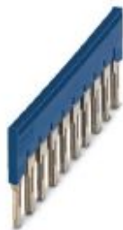
Plug-in bridge, pitch: 8.2 mm, width: 80.3 mm, number of positions: 10, color: blue

Please be informed that the data shown in this PDF Document is generated from our Online Catalog. Please find the complete data in the user's documentation. Our General Terms of Use for Downloads are valid ( http://phoenixcontact.com/download )