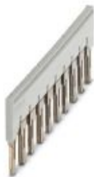
Plug-in bridge, pitch: 8.2 mm, width: 80.3 mm, number of positions: 10, color: gray

Please be informed that the data shown in this PDF Document is generated from our Online Catalog. Please find the complete data in the user's documentation. Our General Terms of Use for Downloads are valid ( http://phoenixcontact.com/download )