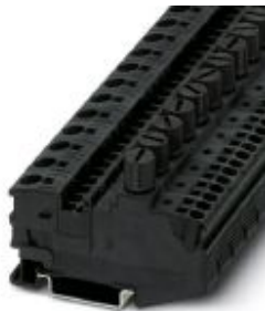
Fuse terminal block for cartridge fuse insert, cross section: 0.5-10 mm 2 , AWG: 20-8, width: 12.2 mm, color: Black

Please be informed that the data shown in this PDF Document is generated from our Online Catalog. Please find the complete data in the user's documentation. Our General Terms of Use for Downloads are valid ( http://phoenixcontact.com/download )