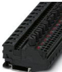
Fuse terminal block for cartridge fuse insert, cross section: 0.5-10 mm 2 , AWG: 20-8, width: 12.2 mm, color: Black

Please be informed that the data shown in this PDF Document is generated from our Online Catalog. Please find the complete data in the user's documentation. Our General Terms of Use for Downloads are valid ( http://phoenixcontact.com/download )