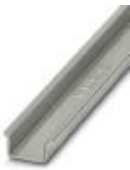
DIN rail, unperforated, Standard profile 2.3 mm, width: 35 mm, height: 15 mm, acc. to EN 60715, material: Steel, galvanized, passivated with a thick layer, length: 2000 mm, color: silver

DIN rail, unperforated - NS 35/15-2,3 UNPERF 2000MM - 1201798