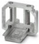
End clamp, for end support of UKH 50 to UKH 240, is pushed onto DIN rail NS 35 and fixed with 2 screws, width: 10 mm, color: aluminum

Marker for terminal blocks - KLM-A + ES/KLM 2-GB - 1004322