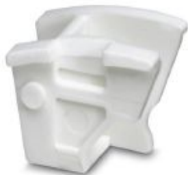
Switching lock, length: 12 mm, width: 8.2 mm, color: white

Please be informed that the data shown in this PDF Document is generated from our Online Catalog. Please find the complete data in the user's documentation. Our General Terms of Use for Downloads are valid ( http://phoenixcontact.com/download )