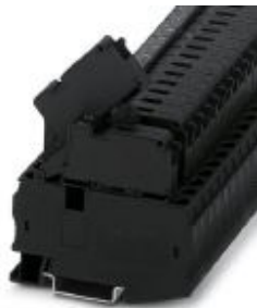
Lever-type fuse terminal block, black, for 6.3 x 32 mm G fuse inserts, with LED for 60 V DC

Please be informed that the data shown in this PDF Document is generated from our Online Catalog. Please find the complete data in the user's documentation. Our General Terms of Use for Downloads are valid ( http://phoenixcontact.com/download )