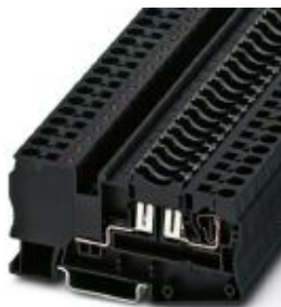
Fuse terminal block with LED for mounting on NS 35, for miniature circuit breakers, terminal width: 8.2 mm, color: Black

Please be informed that the data shown in this PDF Document is generated from our Online Catalog. Please find the complete data in the user's documentation. Our General Terms of Use for Downloads are valid ( http://phoenixcontact.com/download )