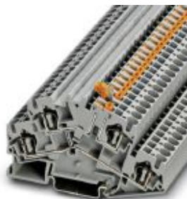
Knife disconnect terminal block, connection method: Spring-cage connection, cross section: 0.08 mm 2 - 6 mm 2 , AWG: 28 - 10, width: 6.2 mm, color: gray, mounting type: NS 35/7,5, NS 35/15

Please be informed that the data shown in this PDF Document is generated from our Online Catalog. Please find the complete data in the user's documentation. Our General Terms of Use for Downloads are valid ( http://phoenixcontact.com/download )