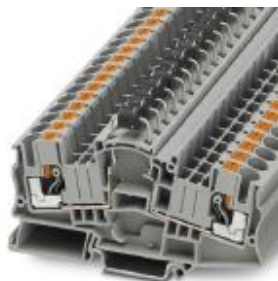
Component terminal block, with integrated P1000Y diode, connection method: Push-in connection, cross section: 0.5 mm 2 - 10 mm 2 , AWG: 20 - 10, width: 8.2 mm, color: gray

Please be informed that the data shown in this PDF Document is generated from our Online Catalog. Please find the complete data in the user's documentation. Our General Terms of Use for Downloads are valid ( http://phoenixcontact.com/download )