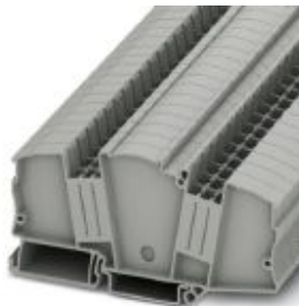
Spacer plate, length: 100.8 mm, width: 8.2 mm, color: gray

Please be informed that the data shown in this PDF Document is generated from our Online Catalog. Please find the complete data in the user's documentation. Our General Terms of Use for Downloads are valid ( http://phoenixcontact.com/download )