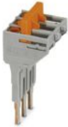
Switching jumper, pitch: 6.2 mm, length: 21.2 mm, width: 18.5 mm, number of positions: 3, color: gray/orange

Please be informed that the data shown in this PDF Document is generated from our Online Catalog. Please find the complete data in the user's documentation. Our General Terms of Use for Downloads are valid ( http://phoenixcontact.com/download )