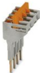
Switching jumper, pitch: 6.2 mm, length: 21.2 mm, width: 24.7 mm, number of positions: 4, color: gray/orange

Please be informed that the data shown in this PDF Document is generated from our Online Catalog. Please find the complete data in the user's documentation. Our General Terms of Use for Downloads are valid ( http://phoenixcontact.com/download )