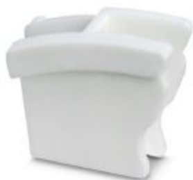
Switching lock, length: 12 mm, width: 6.2 mm, color: white

Please be informed that the data shown in this PDF Document is generated from our Online Catalog. Please find the complete data in the user's documentation. Our General Terms of Use for Downloads are valid ( http://phoenixcontact.com/download )