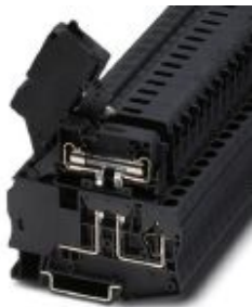
Lever-type fuse terminal block, black, for 6.3 x 32 mm G fuse inserts

Please be informed that the data shown in this PDF Document is generated from our Online Catalog. Please find the complete data in the user's documentation. Our General Terms of Use for Downloads are valid ( http://phoenixcontact.com/download )