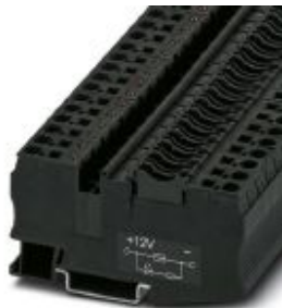
Fuse terminal block with LED for mounting on NS 35, for miniature circuit breakers, terminal width: 8.2 mm, color: Black

Please be informed that the data shown in this PDF Document is generated from our Online Catalog. Please find the complete data in the user's documentation. Our General Terms of Use for Downloads are valid ( http://phoenixcontact.com/download )