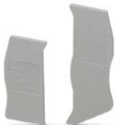
End cover segments, large segment: 32.25 x 13.83 x 0.9, small segment: 22.65 x 11.65 x 0.9, color: gray

Please be informed that the data shown in this PDF Document is generated from our Online Catalog. Please find the complete data in the user's documentation. Our General Terms of Use for Downloads are valid ( http://phoenixcontact.com/download )