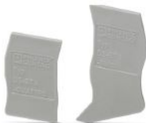
Cover segment, length: 87 mm, height: 36.5 mm, color: gray

Please be informed that the data shown in this PDF Document is generated from our Online Catalog. Please find the complete data in the user's documentation. Our General Terms of Use for Downloads are valid ( http://phoenixcontact.com/download )