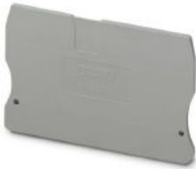
End cover, length: 71.5 mm, width: 2.2 mm, height: 49.9 mm, color: gray

Please be informed that the data shown in this PDF Document is generated from our Online Catalog. Please find the complete data in the user's documentation. Our General Terms of Use for Downloads are valid ( http://phoenixcontact.com/download )