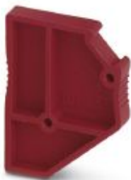
Spacer plate, length: 22.4 mm, width: 4.2 mm, height: 29 mm, number of positions: 1, color: red

Please be informed that the data shown in this PDF Document is generated from our Online Catalog. Please find the complete data in the user's documentation. Our General Terms of Use for Downloads are valid ( http://phoenixcontact.com/download )