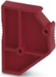
Spacer plate, length: 22.4 mm, width: 5.2 mm, height: 29 mm, number of positions: 1, color: red

Please be informed that the data shown in this PDF Document is generated from our Online Catalog. Please find the complete data in the user's documentation. Our General Terms of Use for Downloads are valid ( http://phoenixcontact.com/download )