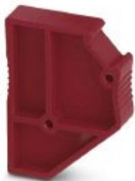
Spacer plate, length: 22.4 mm, width: 6.2 mm, height: 29 mm, number of positions: 1, color: red

Please be informed that the data shown in this PDF Document is generated from our Online Catalog. Please find the complete data in the user's documentation. Our General Terms of Use for Downloads are valid ( http://phoenixcontact.com/download )