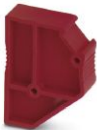
Spacer plate, length: 22.4 mm, width: 8.2 mm, height: 29 mm, number of positions: 1, color: red

Please be informed that the data shown in this PDF Document is generated from our Online Catalog. Please find the complete data in the user's documentation. Our General Terms of Use for Downloads are valid ( http://phoenixcontact.com/download )