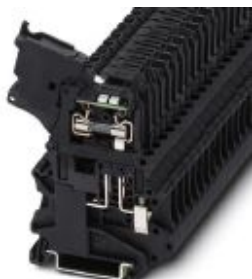
Lever-type fuse terminal block, black, for 5 x 20 mm G fuse inserts, with LED for 24 V DC

Please be informed that the data shown in this PDF Document is generated from our Online Catalog. Please find the complete data in the user's documentation. Our General Terms of Use for Downloads are valid ( http://phoenixcontact.com/download )