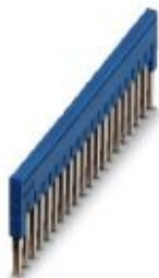
Plug-in bridge, pitch: 5.2 mm, number of positions: 20, color: blue

Please be informed that the data shown in this PDF Document is generated from our Online Catalog. Please find the complete data in the user's documentation. Our General Terms of Use for Downloads are valid ( http://phoenixcontact.com/download )