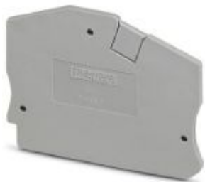
End cover, length: 58 mm, width: 2.2 mm, height: 50 mm, color: gray

Please be informed that the data shown in this PDF Document is generated from our Online Catalog. Please find the complete data in the user's documentation. Our General Terms of Use for Downloads are valid ( http://phoenixcontact.com/download )