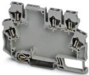
Housing fully equipped, with opening for LED and additional PE contact, 5-pos., color: Gray

Please be informed that the data shown in this PDF Document is generated from our Online Catalog. Please find the complete data in the user's documentation. Our General Terms of Use for Downloads are valid ( http://phoenixcontact.com/download )