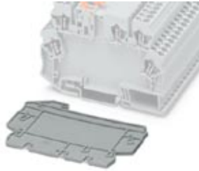
Side cover, for closing the housing for IP20 protection

Please be informed that the data shown in this PDF Document is generated from our Online Catalog. Please find the complete data in the user's documentation. Our General Terms of Use for Downloads are valid ( http://phoenixcontact.com/download )