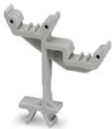
Double marker carrier, snaps onto the spring-cage terminal blocks ST 1.5..., labeled with ZB 4 or ZBF 4

Please be informed that the data shown in this PDF Document is generated from our Online Catalog. Please find the complete data in the user's documentation. Our General Terms of Use for Downloads are valid ( http://phoenixcontact.com/download )