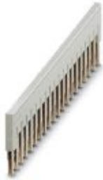
Plug-in bridge, pitch: 5.2 mm, number of positions: 20, color: gray

Please be informed that the data shown in this PDF Document is generated from our Online Catalog. Please find the complete data in the user's documentation. Our General Terms of Use for Downloads are valid ( http://phoenixcontact.com/download )