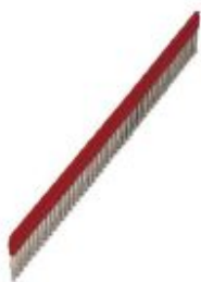
Plug-in bridge, pitch: 5.2 mm, number of positions: 50, color: red

Please be informed that the data shown in this PDF Document is generated from our Online Catalog. Please find the complete data in the user's documentation. Our General Terms of Use for Downloads are valid ( http://phoenixcontact.com/download )