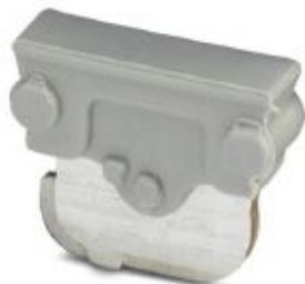
Feed-through connector, length: 10.5 mm, width: 4 mm, color: gray

Please be informed that the data shown in this PDF Document is generated from our Online Catalog. Please find the complete data in the user's documentation. Our General Terms of Use for Downloads are valid ( http://phoenixcontact.com/download )