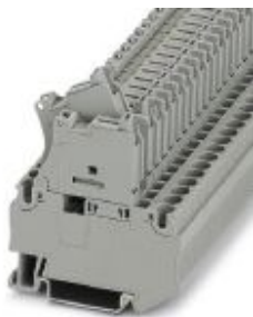
Fuse terminal block for assembly on NS 35, for 5 x 20 cartridge fuse inserts

Please be informed that the data shown in this PDF Document is generated from our Online Catalog. Please find the complete data in the user's documentation. Our General Terms of Use for Downloads are valid ( http://phoenixcontact.com/download )