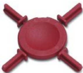
Coding star, length: 3 mm, width: 3 mm, height: 6 mm, color: red

Please be informed that the data shown in this PDF Document is generated from our Online Catalog. Please find the complete data in the user's documentation. Our General Terms of Use for Downloads are valid ( http://phoenixcontact.com/download )