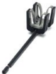
Shield connection clamp, color: black

Please be informed that the data shown in this PDF Document is generated from our Online Catalog. Please find the complete data in the user's documentation. Our General Terms of Use for Downloads are valid ( http://phoenixcontact.com/download )