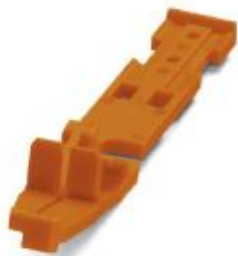
Latching, length: 63.6 mm, width: 9.7 mm, number of positions: 2, color: orange

Please be informed that the data shown in this PDF Document is generated from our Online Catalog. Please find the complete data in the user's documentation. Our General Terms of Use for Downloads are valid ( http://phoenixcontact.com/download )