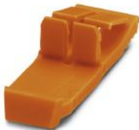
Latching, length: 29.8 mm, width: 10 mm, number of positions: 2, color: orange

Please be informed that the data shown in this PDF Document is generated from our Online Catalog. Please find the complete data in the user's documentation. Our General Terms of Use for Downloads are valid ( http://phoenixcontact.com/download )