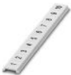
Zack Marker strip, flat, Strip, white, labeled, printed horizontally: consecutive numbers 1 ... 10, 11 ... 20, etc. up to 491 ... 500, mounting type: snap into flat marker groove, for terminal block width: 5 mm, lettering field size: 5.15 x 5.15 mm, Number of individual labels: 10

Zack Marker strip, flat - ZBF 5,LGS:FORTL.ZAHLEN - 0808671