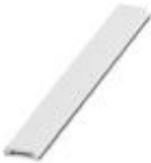
Zack Marker strip, flat, can be ordered: Strip, white, labeled according to customer specifications, mounting type: snap into flat marker groove, for terminal block width: 5 mm, lettering field size: 5.15 x 5.15 mm, Number of individual labels: 10

Zack Marker strip, flat - ZBF 5 CUS - 0825025