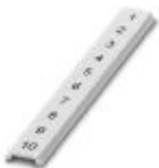
Zack Marker strip, flat, Strip, white, labeled, Printed vertically: consecutive numbers 1 ... 10, 11 ... 20, etc. up to 91 ... 100, mounting type: snap into flat marker groove, for terminal block width: 5 mm, lettering field size: 5.15 x 5.15 mm, Number of individual labels: 10

Zack Marker strip, flat - ZBF 5,QR:FORTL.ZAHLEN - 0808697