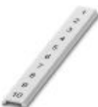
Zack Marker strip, flat, Strip, white, labeled, Printed vertically: consecutive numbers 1 ... 10, 11 ... 20, etc. up to 91 ... 100, mounting type: snap into flat marker groove, for terminal block width: 5 mm, lettering field size: 5.15 x 5.15 mm, Number of individual labels: 10

Zack Marker strip, flat - ZBF 5,QR:FORTL.ZAHLEN - 0808697