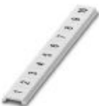
Zack Marker strip, flat, Strip, white, labeled, printed horizontally: consecutive numbers 1 ... 10, 11 ... 20, etc. up to 491 ... 500, mounting type: snap into flat marker groove, for terminal block width: 5 mm, lettering field size: 5.15 x 5.15 mm, Number of individual labels: 10

Zack Marker strip, flat - ZBF 5,LGS:FORTL.ZAHLEN - 0808671