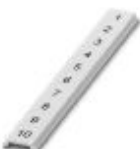
Zack Marker strip, flat, Strip, white, labeled, Printed vertically: consecutive numbers 1 ... 10, 11 ... 20, etc. up to 91 ... 100, mounting type: snap into flat marker groove, for terminal block width: 5 mm, lettering field size: 5.15 x 5.15 mm, Number of individual labels: 10

Zack Marker strip, flat - ZBF 5,QR:FORTL.ZAHLEN - 0808697