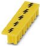
Warning cover, 5-pos., for terminal width: 5.2 mm

Zack Marker strip, flat - ZBF 5 CUS - 0825025