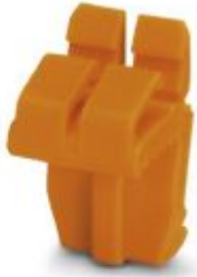
Latching, length: 15.8 mm, width: 10 mm, number of positions: 2, color: orange

Please be informed that the data shown in this PDF Document is generated from our Online Catalog. Please find the complete data in the user's documentation. Our General Terms of Use for Downloads are valid ( http://phoenixcontact.com/download )