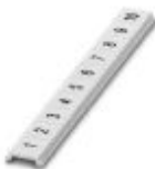
Zack Marker strip, flat, Strip, white, labeled, printed horizontally: consecutive numbers 1 ... 10, 11 ... 20, etc. up to 491 ... 500, mounting type: snap into flat marker groove, for terminal block width: 5 mm, lettering field size: 5.15 x 5.15 mm, Number of individual labels: 10

Zack Marker strip, flat - ZBF 5,LGS:FORTL.ZAHLEN - 0808671