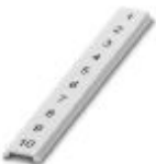
Zack Marker strip, flat, Strip, white, labeled, Printed vertically: consecutive numbers 1 ... 10, 11 ... 20, etc. up to 91 ... 100, mounting type: snap into flat marker groove, for terminal block width: 5 mm, lettering field size: 5.15 x 5.15 mm, Number of individual labels: 10

Zack Marker strip, flat - ZBF 5,QR:FORTL.ZAHLEN - 0808697