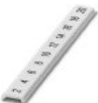
Zack Marker strip, flat, Strip, white, labeled, printed horizontally: consecutive numbers 2 ... 20, 22 ... 40, etc. up to 82 ... 100, mounting type: snap into flat marker groove, for terminal block width: 5 mm, lettering field size: 5.15 x 5.15 mm, Number of individual labels: 10

Zack Marker strip, flat - ZBF 5,LGS:GERADE ZAHLEN - 0810821