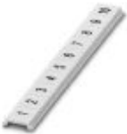
Zack Marker strip, flat, Strip, white, labeled, printed horizontally: consecutive numbers 1 ... 10, 11 ... 20, etc. up to 491 ... 500, mounting type: snap into flat marker groove, for terminal block width: 5 mm, lettering field size: 5.15 x 5.15 mm, Number of individual labels: 10

Zack Marker strip, flat - ZBF 5,LGS:FORTL.ZAHLEN - 0808671