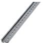
DIN rail perforated, Standard profile, width: 35 mm, height: 7.5 mm, acc. to EN 60715, material: Steel, Galvanized, white passivated, length: 2000 mm, color: silver

DIN rail perforated - NS 35/ 7,5 WH PERF 2000MM - 1204119