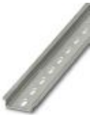
DIN rail perforated, Standard profile, width: 35 mm, height: 7.5 mm, acc. to EN 60715, material: Steel, galvanized, passivated with a thick layer, length: 2000 mm, color: silver

DIN rail perforated - NS 35/ 7,5 PERF 2000MM - 0801733