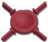
Coding star, length: 3 mm, width: 3 mm, height: 6 mm, color: red