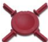
Coding star, length: 3 mm, width: 3 mm, height: 6 mm, color: red