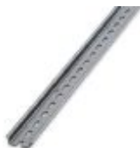
DIN rail perforated, Standard profile, width: 35 mm, height: 7.5 mm, acc. to EN 60715, material: Steel, Galvanized, white passivated, length: 2000 mm, color: silver

DIN rail perforated - NS 35/ 7,5 WH PERF 2000MM - 1204119