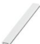
Zack Marker strip, flat, Strip, can be ordered: Strip, white, labeled according to customer specifications, mounting type: snap into flat marker groove, for terminal block width: 6.2 mm, lettering field size: 5.15 x 6.15 mm, Number of individual labels: 10

Zack Marker strip, flat - ZBF 6 CUS - 0825027