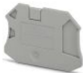
End cover, length: 56.8 mm, width: 2.2 mm, height: 39.8 mm, color: gray