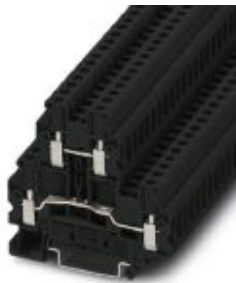
Double-level terminal block, connection method: Screw connection, cross section: 0.14 mm 2 - 4 mm 2 , AWG: 26 - 12, width: 5.2 mm, color: black, mounting type: NS 35/7,5, NS 35/15

Please be informed that the data shown in this PDF Document is generated from our Online Catalog. Please find the complete data in the user's documentation. Our General Terms of Use for Downloads are valid ( http://phoenixcontact.com/download )