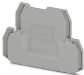
End cover, length: 80.1 mm, width: 2.2 mm, height: 57.4 mm, color: gray

Please be informed that the data shown in this PDF Document is generated from our Online Catalog. Please find the complete data in the user's documentation. Our General Terms of Use for Downloads are valid ( http://phoenixcontact.com/download )